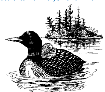
Limited space available; reservations and advance payment required unless otherwise noted. Programs are subject to cancellation if minimum enrollment is not met.